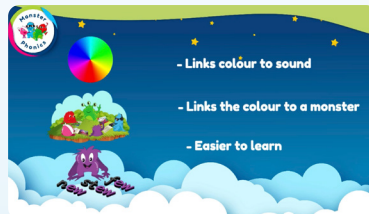
What is Monster Phonics?