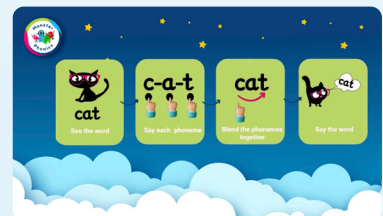
Blending and Segmenting