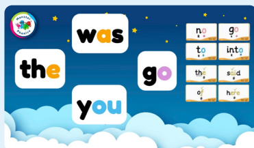
Tricky Words and High-Frequency Words