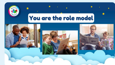
The Importance of Reading with Your Child