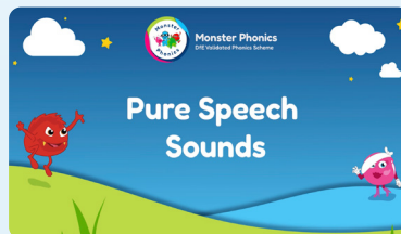
Pure Sounds Video.