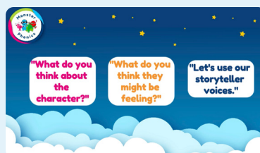
10 Top Tips When Reading With Your Child