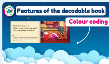
Tricky Words and High-Frequency Words