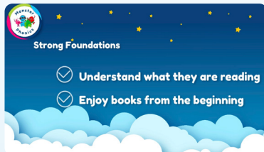
What is phonics and why does it matter?

Each video is clear, practical and only takes a few minutes to watch.